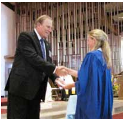
Below - 1st place essay winner