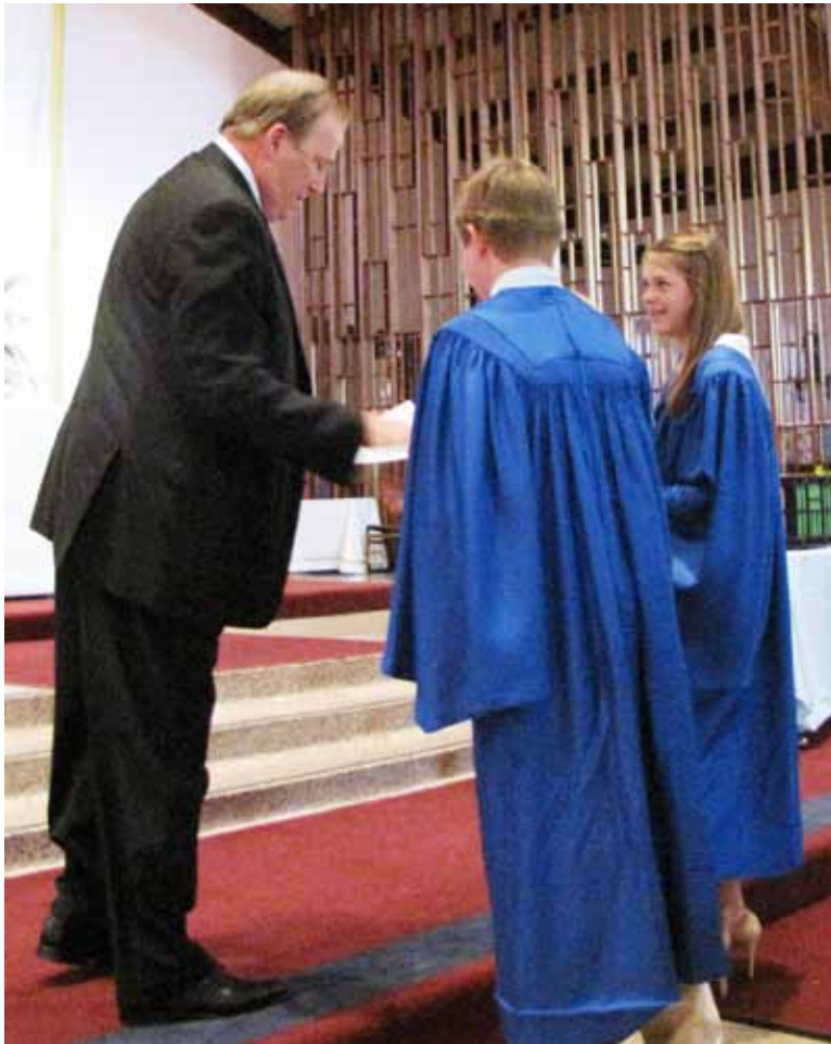
Above - 3rd place essay winners

Thanks to all the Knights who took time to judge the essays. Thanks to all the students who participated! All of the essays were great and as usual the winners were hard to choose.