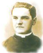
The Venerable Father J. McGivney, Founder of the Knights of Columbus